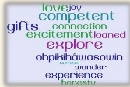
Some words we associate with awasisak, children

As a Division we will work towards the restoration of wahkohtowin and reinstating what colonization has eroded.